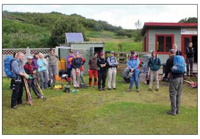
Volunteers being briefed at Thorsmork before a days work

The Thórsmörk trail volunteer programme was established by Iceland's Forest Service in 2012. Its main role is to assist with the maintenance of the hiking trails in Thórsmörk and Goðaland. The programme was established in response to the growing need for practical maintenance work in the area. Three volunteer teams are active throughout the summer months. As well as ongoing maintenance tasks, an important part of their work is the development of new techniques for trail construction and erosion control.