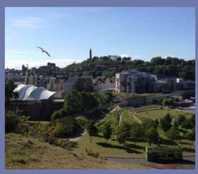
City of Edinburgh

58% to see the scenery and landscape ... 31% to learn more about the history and culture of Scotland