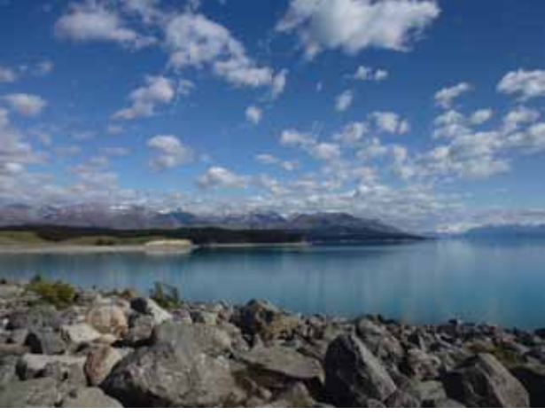
Lake Tekapo National Park - New Zealand

1.4 Wales has some geo-political similarities to Scotland within the UK and has three National Parks and four Areas of Outstanding Natural Beauty. A recent study has shown that the three Welsh National Parks attract around 12 million visits per annum and some £1billion pa of spending. A study calculated that £557 million per annum was added to the Welsh economy as a direct result of the presence of the National Parks with average visitor spend per head per day of £87. This was considerably higher than the UK average of £60 per day, primarily due to the longer overnight stays. There were almost 30,000 jobs located in the three Welsh National Parks and over 5,000 businesses, many of them tourism related.