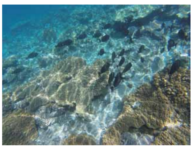
Australia's Great Barrier Reef