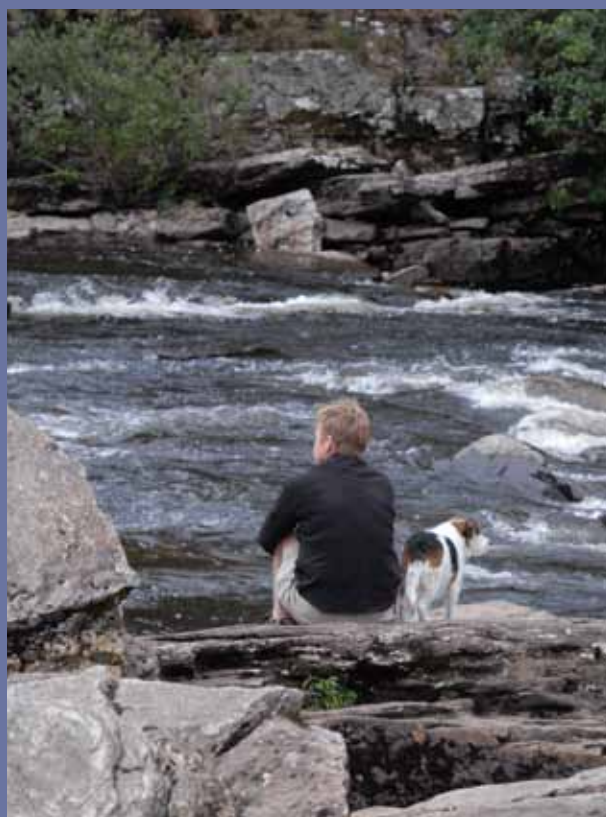
Falls of Dochart – Killin