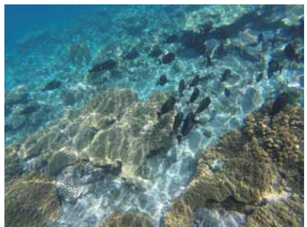
Australia's Great Barrier Reef