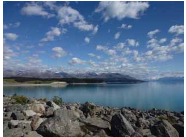
Lake Tekapo National Park – New Zealand

1.4 Wales has some geo-political similarities to Scotland within the UK and has three National Parks and four Areas of Outstanding Natural Beauty. A recent study has shown that the three Welsh National Parks attract around 12 million visits per annum and some £1billion pa of spending. A study calculated that £557 million per annum was added to the Welsh economy as a direct result of the presence of the National Parks with average visitor spend per head per day of £87. This was considerably higher than the UK average of £60 per day, primarily due to the longer overnight stays. There were almost 30,000 jobs located in the three Welsh National Parks and over 5,000 businesses, many of them tourism related.