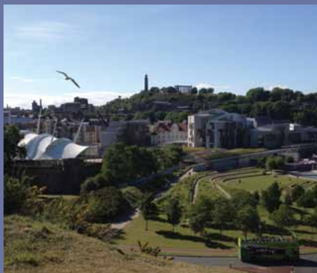
City of Edinburgh

58% to see the scenery and landscape ... 31% to learn more about the history and culture of Scotland