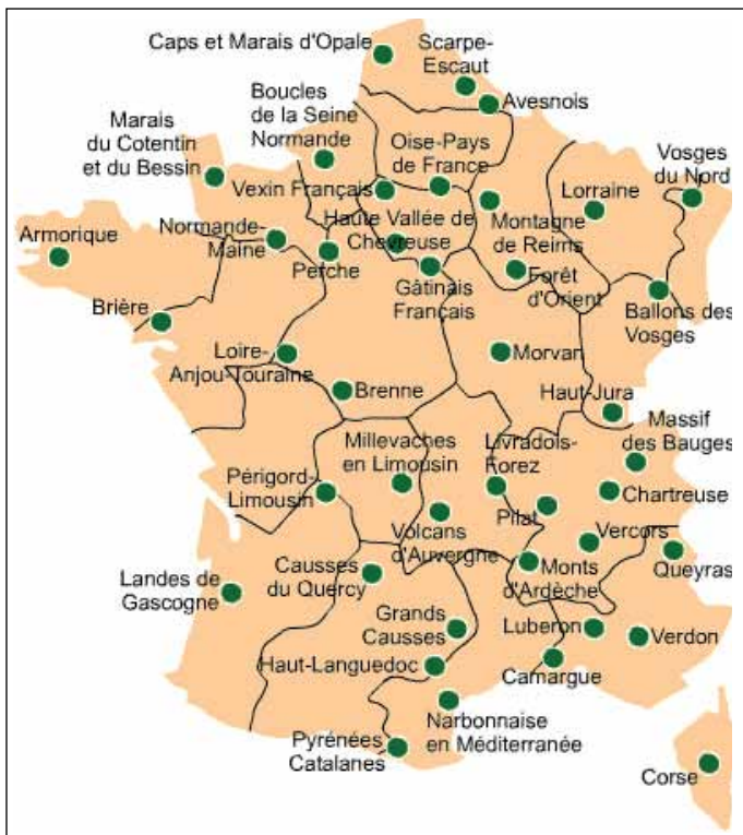
Regional Natural Parks in France

There are 45 Regional Natural Parks in France. They cover 13% of its territory involving 3,706 communes, over seven million hectares of land and have more than three million inhabitants.