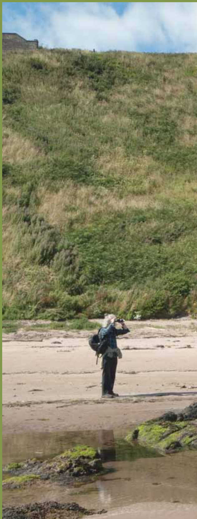
St Cyrus National Nature Reserve