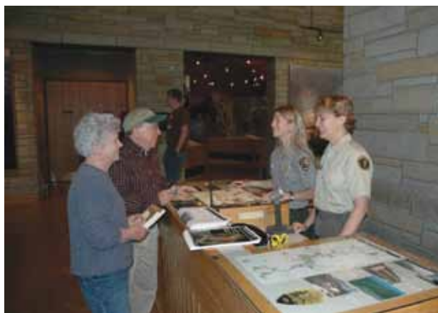
Volunteer Information Assistants Canyon Rim Visitor Centre – USA

5.3 The role of a Scottish National Parks Service would be to serve and support the lead authority for each of the individual Parks, not to direct them as if they were a single, national entity. In particular it would be vital to ensure that the responsibility for decision-making on planning matters remained with a clearly identifiable, locally accountable forum. A National Parks Service could be an independent body or alternatively could be attached to an existing organisation, with Scottish Natural Heritage being the obvious candidate.