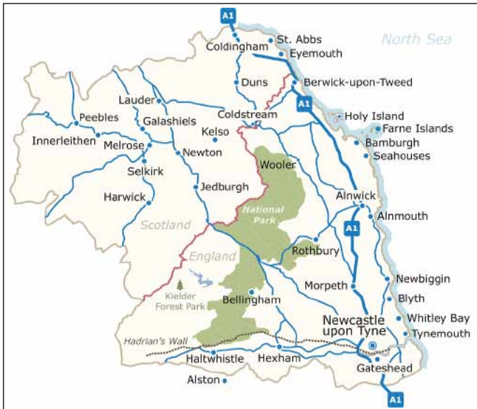
Northumberland National Park

The Northumberland National Park was established in 1956. It is one of the thirteen National Parks in England and Wales. The Northumberland National Park Authority seeks to conserve and enhance the natural beauty, wildlife and cultural heritage of the Northumberland uplands – 405 square miles of hills and valleys stretching from Hadrian's Wall northwards to the Cheviot Hills on the border with Scotland. It also promotes opportunities for the understanding and enjoyment of the area by the public. The park has a small resident population of 2,200 with the park boundary excluding most of the villages which sit just outside the park but benefit from its protection and promotion.