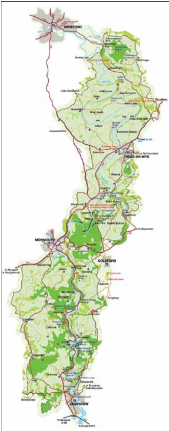
Wye Valley – Area of Outstanding Natural Beauty

The Wye Valley Area of Outstanding Natural Beauty is an internationally important protected landscape straddling the border between England and Wales. It is one of the most dramatic and scenic landscape areas in southern Britain. The AONB designated in 1971 covers parts of the counties of Gloucestershire, Herefordshire and Monmouthshire, and is recognised in particular for its limestone gorge scenery and dense native woodlands, as well as its wildlife, archaeological and industrial remains.