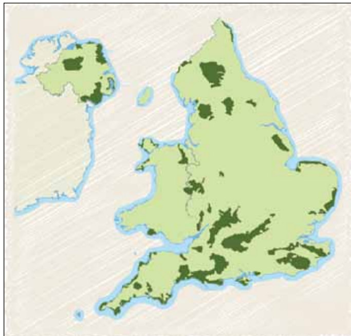
AONBs in England, Wales and Northern Ireland

There are 46 AONBs in England Wales and Northern Ireland. Designation seeks to protect and enhance natural beauty whilst recognising the needs of the local community and economy. This includes the protection of flora, fauna and geological as well as landscape features including the conservation of archaeological, architectural and vernacular features in the landscape.