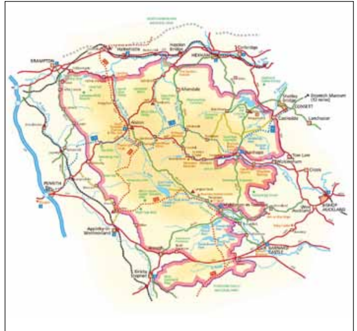
North Pennines – Area of Outstanding Natural Beauty

The North Pennines AONB is one example of an AONB and is described below.